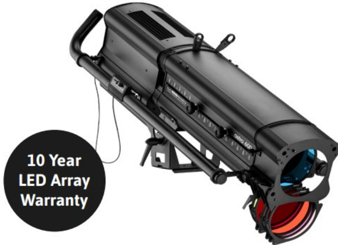
CANTO ASTRO 600

CANTO is the trusted name in modern follow spots. Bright, modular, and ease of use are the trademarks of this economical line of units that can go anywhere and perform multiple tasks. The Italian design is simple and elegant with ergonomic handling and easy to understand labeling. It's all-in-one ordering system guarantees that the unit is delivered with everything needed to plug the fixture into the wall and begin your show. Canto followspots are great for schools, universities, professional theater, touring and houses of worship.