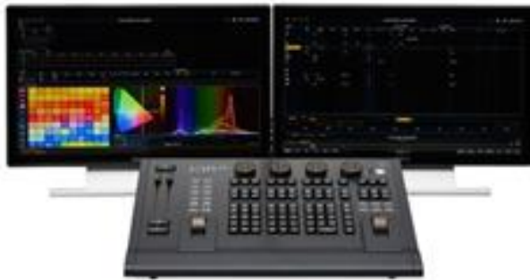
ETC ION XE Lighting Console 2K

Updated hardware for the ION brand within the larger ETC EOS family!