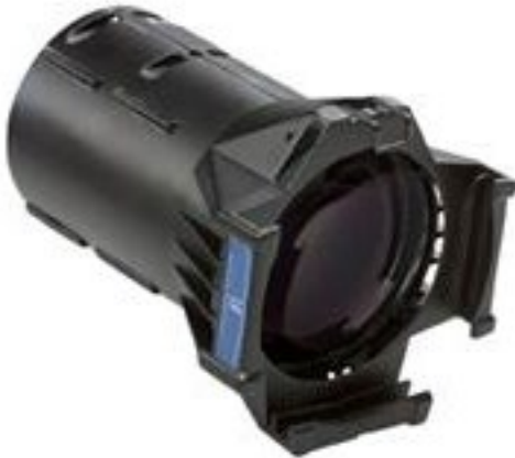
ETC S4 19° E.D. Lens Tube - #419EDLT

When your lighting situation requires even more precise optics for projecting images, gobos, and logos, the Source Four EDLT (Enhanced Definition Lens Tube) is a valuable addition to your Source Four inventory. The EDLT attaches easily to any new or existing fixed-focus Source Four ellipsoidal spotlight. While increasing light output up to 10%, EDLT also provides heightened sharpness and improved contrast to images when the Source Four is used as a pattern projector. EDLT is available in 19°, 26°, 36°, and 50° angles.