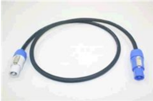
Stage Ext Cable 12/3 SJ PowerCON 5'

PowerCON extension cables are constructed with 12/3 SJ cable and genuine Neutrik PowerCON connectors. This cable is often used for powering modern LED fixtures that have built-in power supplies.