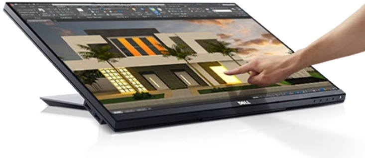
DELL 24" Touch Monitor