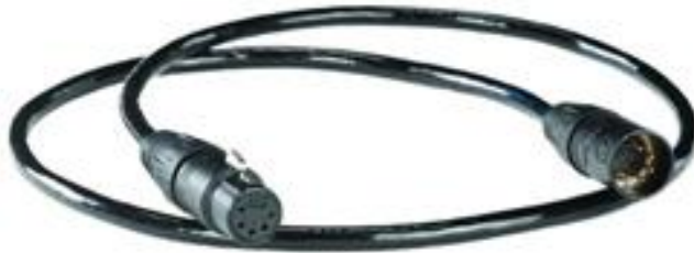
DMX Cable 5-pin B/G 5'

DMX Data Communications Cable – 5’ $30 each – Need 40