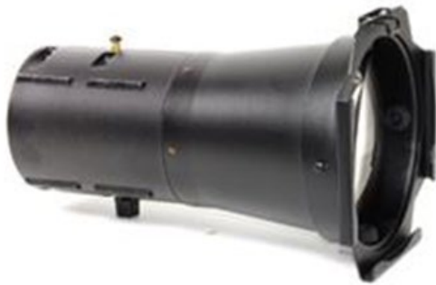
ETC S4 14° Lens Tube - #414LT

Make your existing Source 4 fixture more versatile. Easily swap out one field angle for another in under 30 seconds with no tools required.