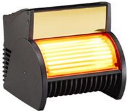
ETC ColorSource CYC, 5-pin XLR, Black

ETC ColorSource CYC, 5-pin XLR $1400 each - Need 12