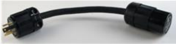
Stage Ext Cable 12/3 SOOW L5-20 25'

Extension cables are constructed with 12/3 SOOW cable. This heavy duty cable is recommended for stage applications.