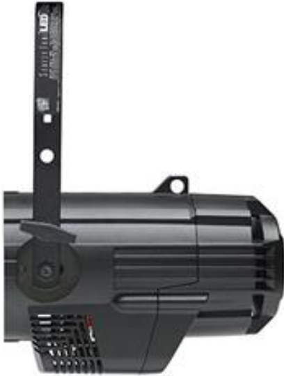
ETC S4 LED Series 2 Lustr Engine - BLACK

The Source Four LED Series 2 Lustr introduces a new level of LED lighting. Like the original Source 4 LED, this unit uses the x7 Color System combining a balanced recipe of up to seven colors to create evocative color mixes. The Source Four LED Series 2 Lustr array takes the idea even further, with the addition of a lime-green LED emitter. Lime green increases the luminaire's lumen output in open white and lighter tints to make them brighter and livelier, better matching the color of a conventional Source Four® fixture. The lime also enriches color-rendering by better marrying the red and blue ends of the color spectrum, for truer-to-life light that fills in the gaps that ordinary LEDs leave behind. We also added more red to the x7 Color System in the Source Four LED Series 2 Lustr array. Working in unison with the lime-green emitter, the extra red means the luminaire can produce ambers, straws and pinks up to three hundred percent as bright as those from the original Source Four LED™.