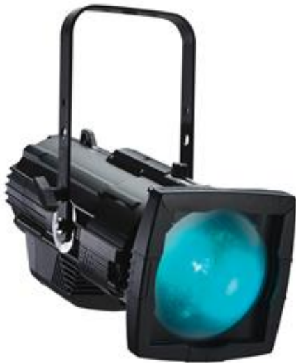
S4 LED Fresnel Adapter #S4LEDFRES

The adapter fits any Source Four LED light engine and creates tunable-white or brightly-colored washes with soft edges. The light blends evenly – with smooth overlap and uniform distribution – for washes that look dazzling, even on camera! The Fresnel adapter is adept at sculpting light using traditional barn-door technology and attachments, to customize the look and shape of the light. And with the highest-quality light output, the Source Four LED Fresnel can be used in any application – on stage or in the studio.