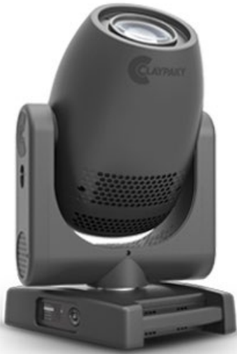
Axcor Profile 400

The Axcor Profile 400 enhances the medium-low power category with sophisticated professional functions. It has an extraordinarily compact body (65 cm / 25½ inches high) packed with all the most advanced lighting, mechanical and electronic features. These include a professional framing system, an animation wheel, a CMY + linear CTO system, and a high precision mechanical iris.