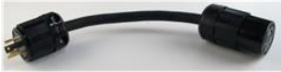
Stage Ext Cable 12/3 SOOW L5-20 5'

Extension cables are constructed with 12/3 SOOW cable. This heavy duty cable is recommended for stage applications.