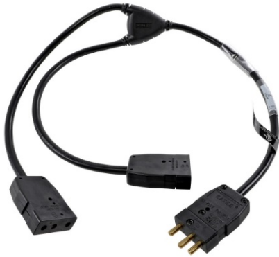
Molded Twofer PE/Pintech 2P&G 36"

Fully assembled twofer assembly using rugged molded twofer block and 20A stage pin (2P&G) connectors. All black construction.