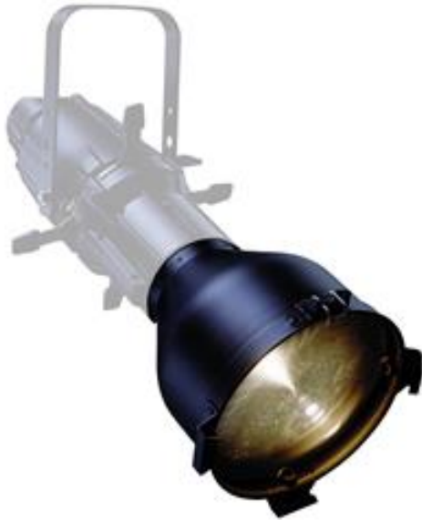
ETC S4 10° Lens Tube - #410LT

Make your existing Source 4 fixture more versatile. Easily swap out one field angle for another in under 30 seconds with no tools required.