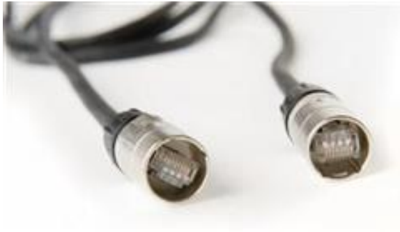
Cat5E EtherCON Ultimate Cable 6'

This Cat5E cable features heavy duty construction using 100% shielded 4-pair cable with Neutrik Ethercon NE8MC terminations at both ends.