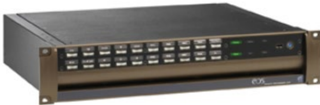
ETC EOS RPU3

ETC's Eos® RPU3 can provide primary and backup control in Ti™, Eos, Gio® and Gio @5 control systems, or it can be used as a stand-alone lighting playback unit. A 2U device, it can be mounted into 19" equipment racks or road cases.