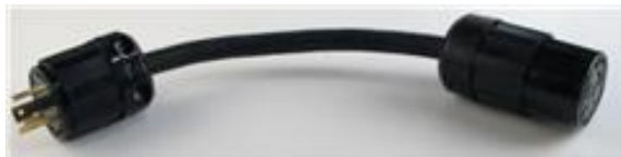
Stage Ext Cable 12/3 SOOW L5-20 10'

Extension cables are constructed with 12/3 SOOW cable. This heavy duty cable is recommended for stage applications.