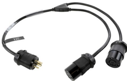
Molded Twofer PE/Leviton L5-20 36"

Fully assembled twofer assembly using rugged molded twofer block and 20A twistlock (L5-20) connectors. All black construction.